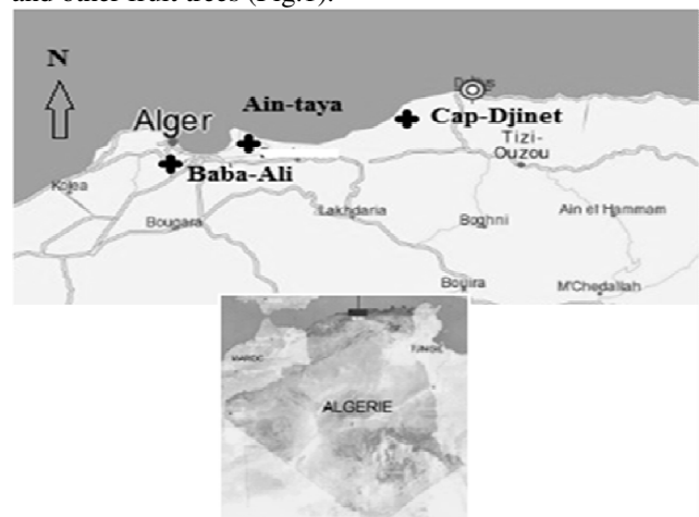
Fig.1. Location of the study area

The station is the area or the precise location at which the study area of the orthopterologic inventory is made. The study surveyed stations are represented by three different agroecosystems. Two of them belong to the Mitidja which is the largest of sublittoral Algerian plain, bordered by a range of mountains [12]. This is a plot fallow located in Baba-Ali (36° 42 '59" North, 3° 9' 00" East) and cultivated fields; mainly potatoes, peas and zucchini located in the region of Ain-Taya (36° 47 '00" North, 3 ° 14' 00" East). The third station is the pilot farm in the region of Cap-Djinet, daira Bordj Menail, wilaya of Boumerdes (36 ° 48 'north latitude and 3°42' east longitude); it is arboreal vocation where there are various varieties of olive trees and other fruit trees (Fig.1).