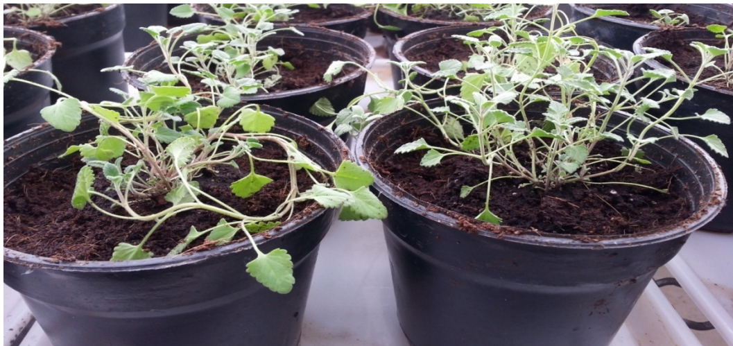
Fig.2. Plantlets of D. kotschy with normal growth after hardening of in vitro gathered micro shoots.