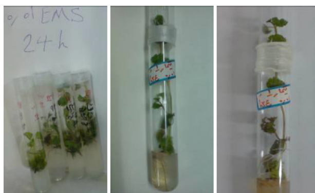
A-Day treatment B- Ten days after treatment C- One month after treatment