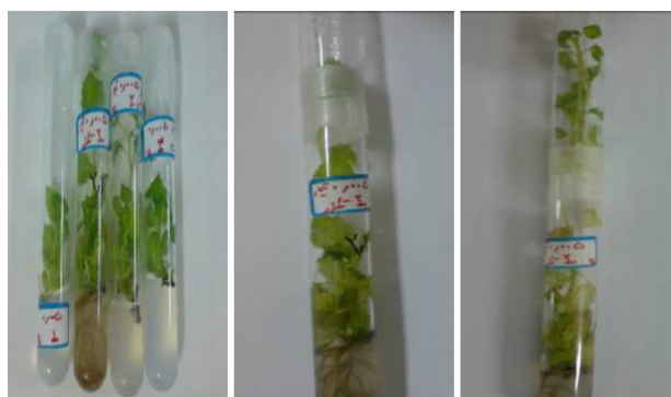
A-Day treatment B- Ten days after treatment C- One month after treatment