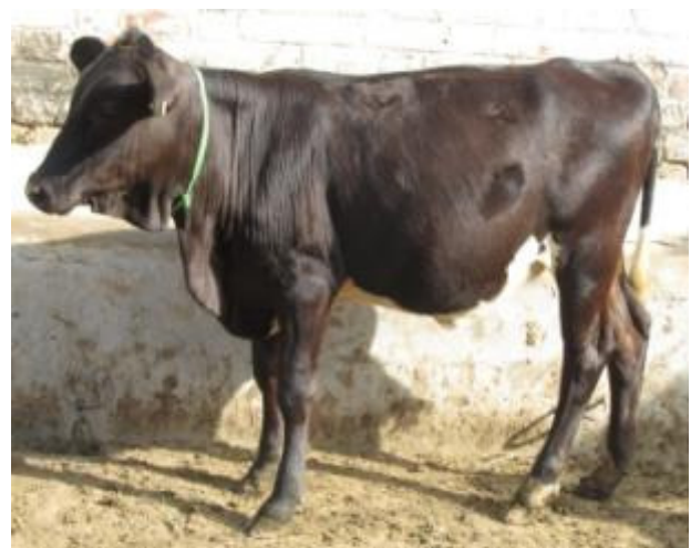
Fig.3. A pair of calf after 4 months under control (L: body wt.: 122 kg) and experimental (R: body wt.:150 kg) groups, born on the same day