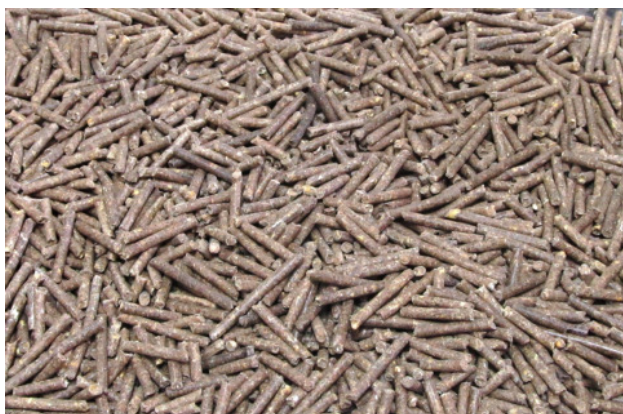
Fig.1. Calf starter in pellets form used for feeding trial