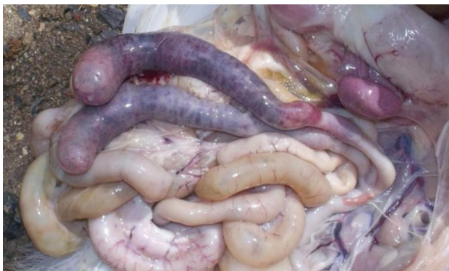
Photo 5. Cecal hemorrhages in chicken eimeriasis caused by E. tenella

A pathomorphological study of the corpses of chickens died from eimeriasis has demonstrated changes typical for this disease. Namely, the corpses were exhausted, the feathers in the cloacal area were stained with feces, the earrings, comb and conjunctiva were anemic, the muscle tissue was flabby. The mucous membranes of the large intestine, especially the caeca, were hemorrhagically inflamed, and sometimes covered with blood clots (see photo 5). Granular dystrophy was detected in parenchymal organs.