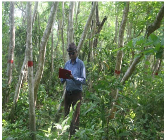
b) Researchers are collecting data in plantation site.