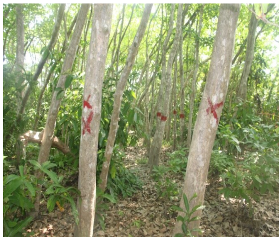
d) An overview of experimental plantation site