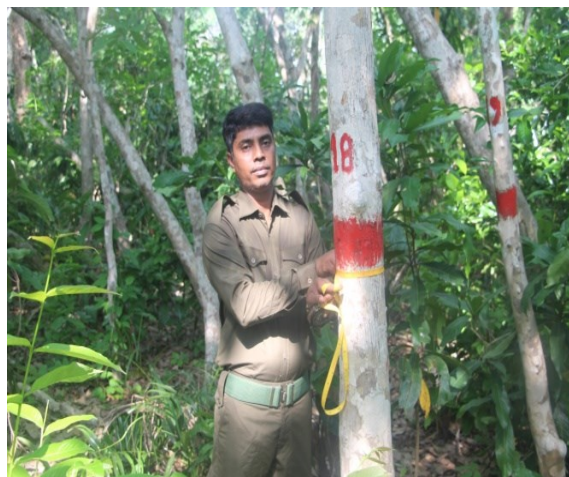
c) Forest Guard are measuring DBH (1.3m) in plantation site