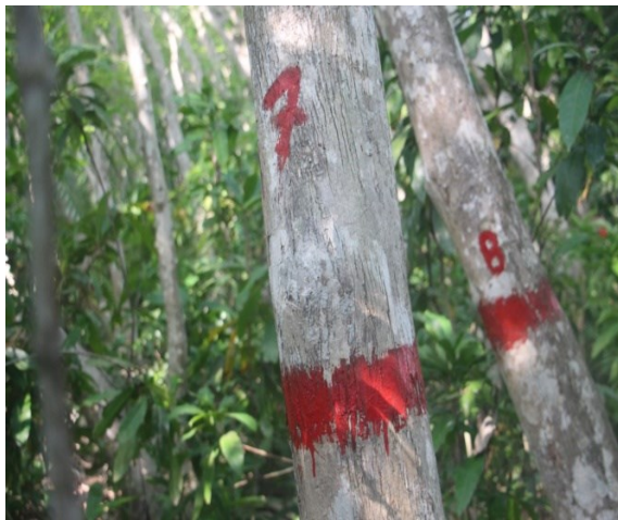
a) Numbering of species in the replication

Experiments with Jarul plants were laid out in less salinity zones of the Sundarbans (Compartment No. 01). The experimental plantations of Jarul were raised by planting nursery raised seedlings in polybags in Randomized Complete Block Design (RCBD) at 1.0m×1.0m, 1.5m×1.5m, 2.0m×2.0m spacing in three replications with nine plots (spacing varies according to purpose of research, species variation and site condition) (Figure- 2. d). A total of 0.19 ha experimental plantations were maintained properly in the Sundarbans. Planting was carried out in June, 1993 with the onset of monsoon. Each trees are numbered by red color enamel paint (Figure-2.a). Experimental plantations were initially protected by fencing against browsing up to the period it reached beyond the browsing height. Three weeding were done in the first year and two weddings in the subsequent years.