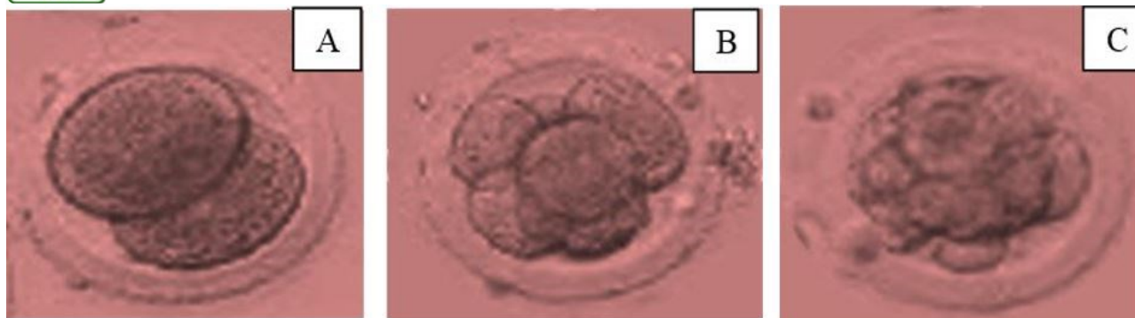
Fig. 3. Representative photograph showing different stages of embryos development. A = 2-cell embryos, B = 8-cell embryos, and C = Compact morula.