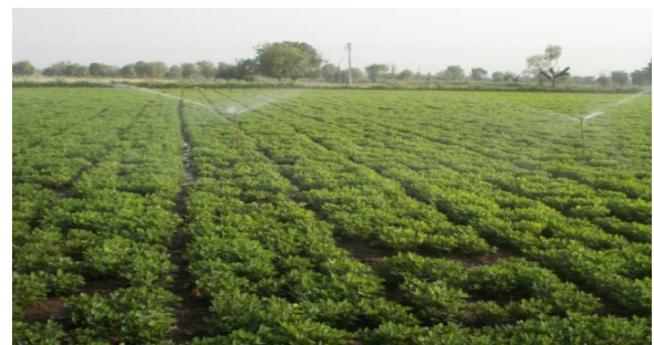
Fig 1. Groundnut crop sown on broad bed and furrow planter

Trainings, demonstrations, regular filed visit and display of implements in exhibitions, kisan mobile SMS service and live demonstration under FLD are organized by KVK through various programmes for farmer's participation.