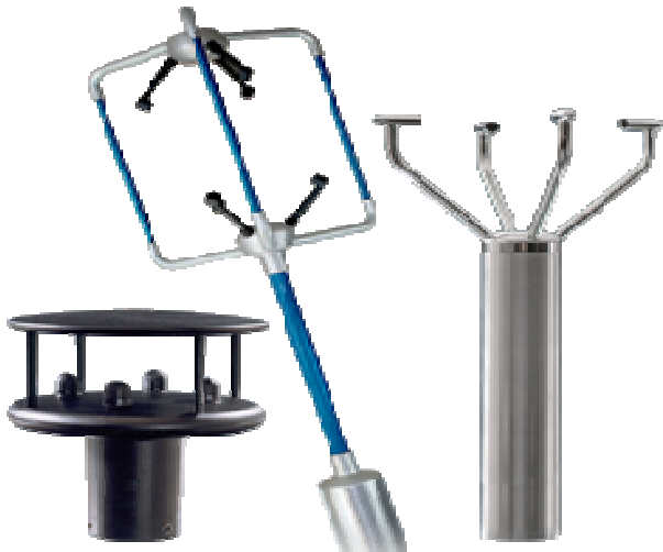
Fig. 4. Gill® Ultrasonic Anemometers (Precision Wind Speed & Direction, 2, 3-axis ultrasonic anemometers)