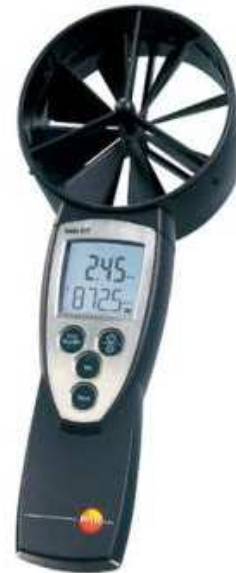
Fig. 3. Testo @ 417 Vane Anemometer.

In most applications, this technique uses small windmill-like turbines with diameters varying between 10 mm and 150 mm to measure the airspeed within the range of 0.5 to 10 m/s. The diameter of these systems is much smaller than the diameter of the ventilation chimney. The system is calibrated in such a way that the rotational speed of the impeller is a measure of the airspeed (fig. 3).