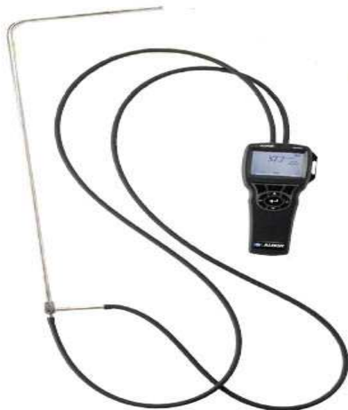
Fig. 5. Topac.com ® Pitot Tube Anemometer

The accurate measurement of both air velocity and volumetric airflow can be accomplished using a Pitot tube (fig. 5), a differential pressure transducer, and a computer system which includes the necessary hardware and software to convert the raw transducer signals into the proper engineering units [85].