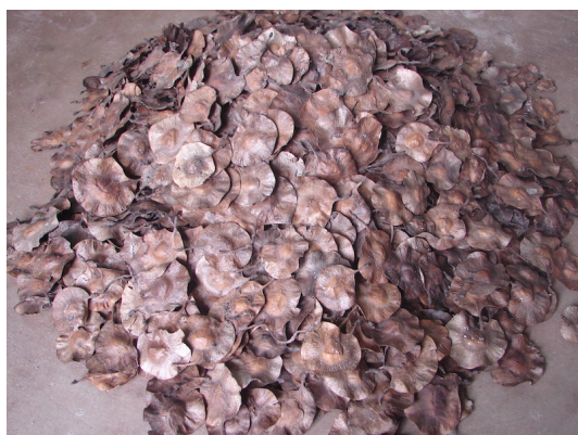
Fig. 1.Pods of Pterocarpusmarsupium

** Significant at 1 % level; * significant at 5% level; ns non significant at 5 % level