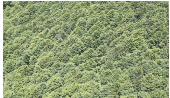
Fig. 1.The chestnut missives in study zone.

This surface for every district is as follows: