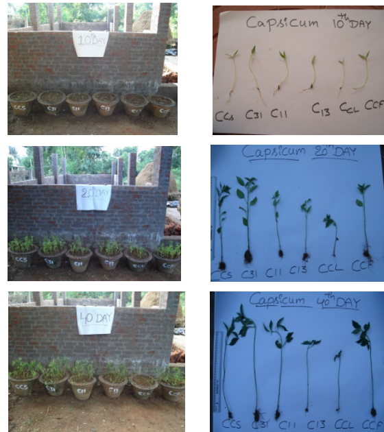
Fig.2. Capsicum cultivated in experimental pots on 10 th , 20 th & 40 th day