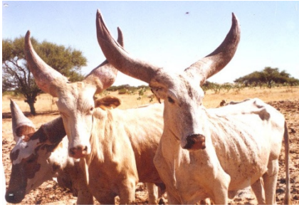
Figure 1: Kuri female in its natural environment