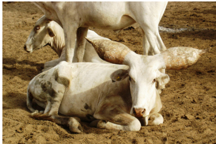
Fig.2. Kuri heifer from CSK in Lake Chad

Sampling: on first lactation, 18,800 observations were made on 80 Kuri females; during second lactation, 10,575 measurements were carried out on 45 cows and during third lactation, 3,290 observations were made on 14 females.