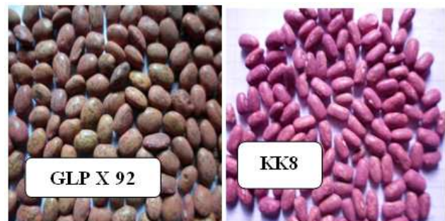
Fig.1. Common improved bean varieties grown in western Kenya